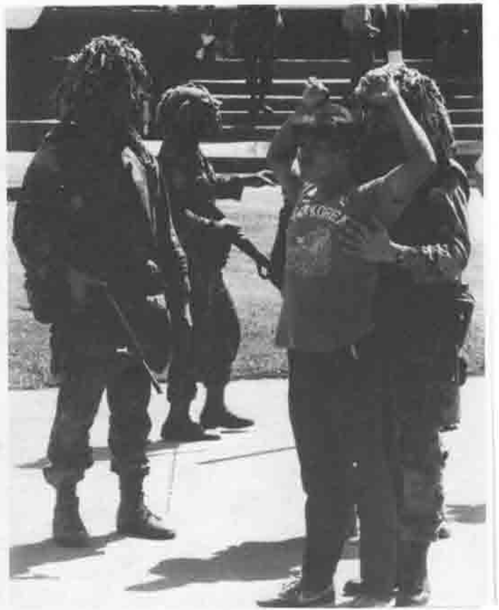
A SHAKEDOWN AND 'TRANSPORT' OF PRISONERS BY 3RD BRIGADE.