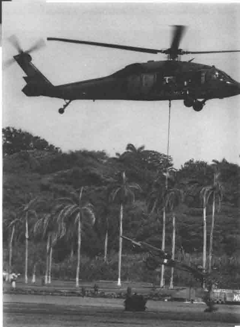
FREEDOM OF MOVEMENT CONVOY