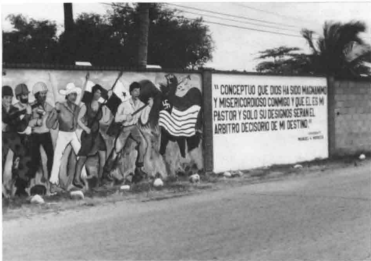
ANTI-US PROPOGANDA AT RIO HATO. NOTE THE EAGLE AND FLAG.