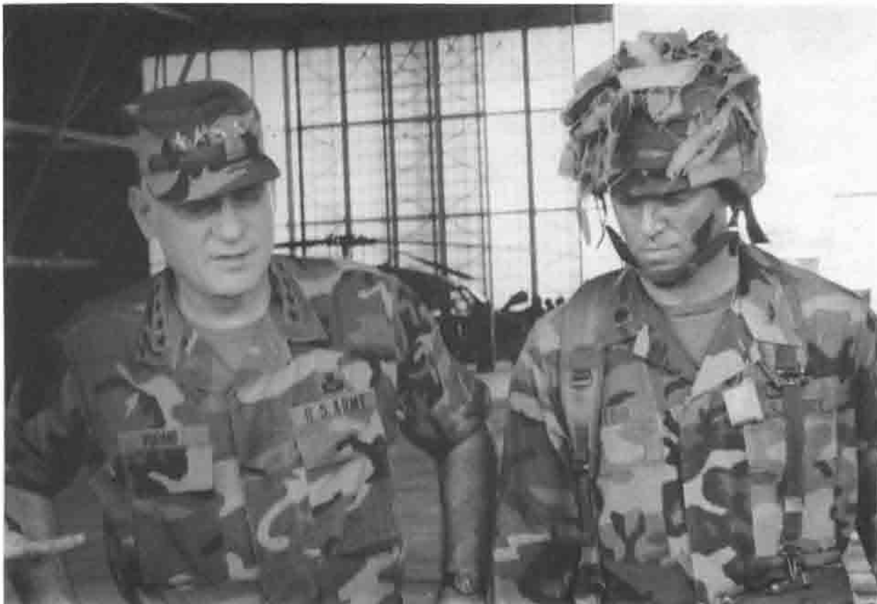
CHIEF OF STAFF OF THE ARMY, GEN VUONO AND LTC WEBB, TASK FORCE AVIATION, DISCUSS OPERATIONS.