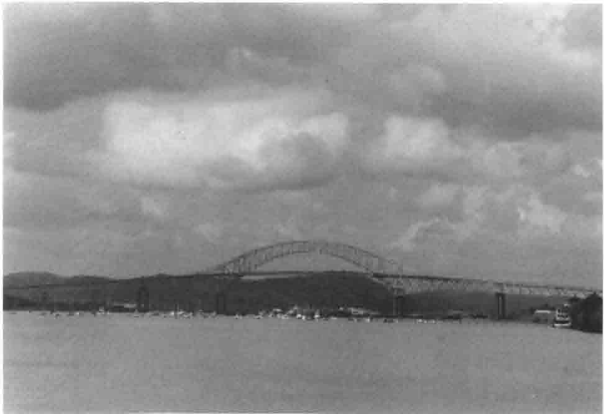
BRIDGE OF THE AMERICAS AND MADDEN DAM WERE BOTH KEY DEFENSE SITES ON 20 DECEMBER.