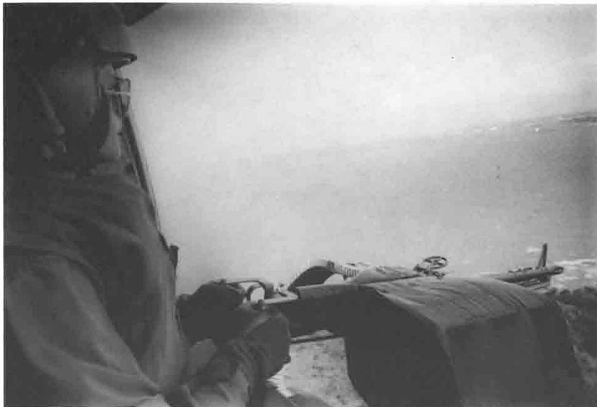
TASK FORCE AVIATION DOOR GUNNER AT THE READY.