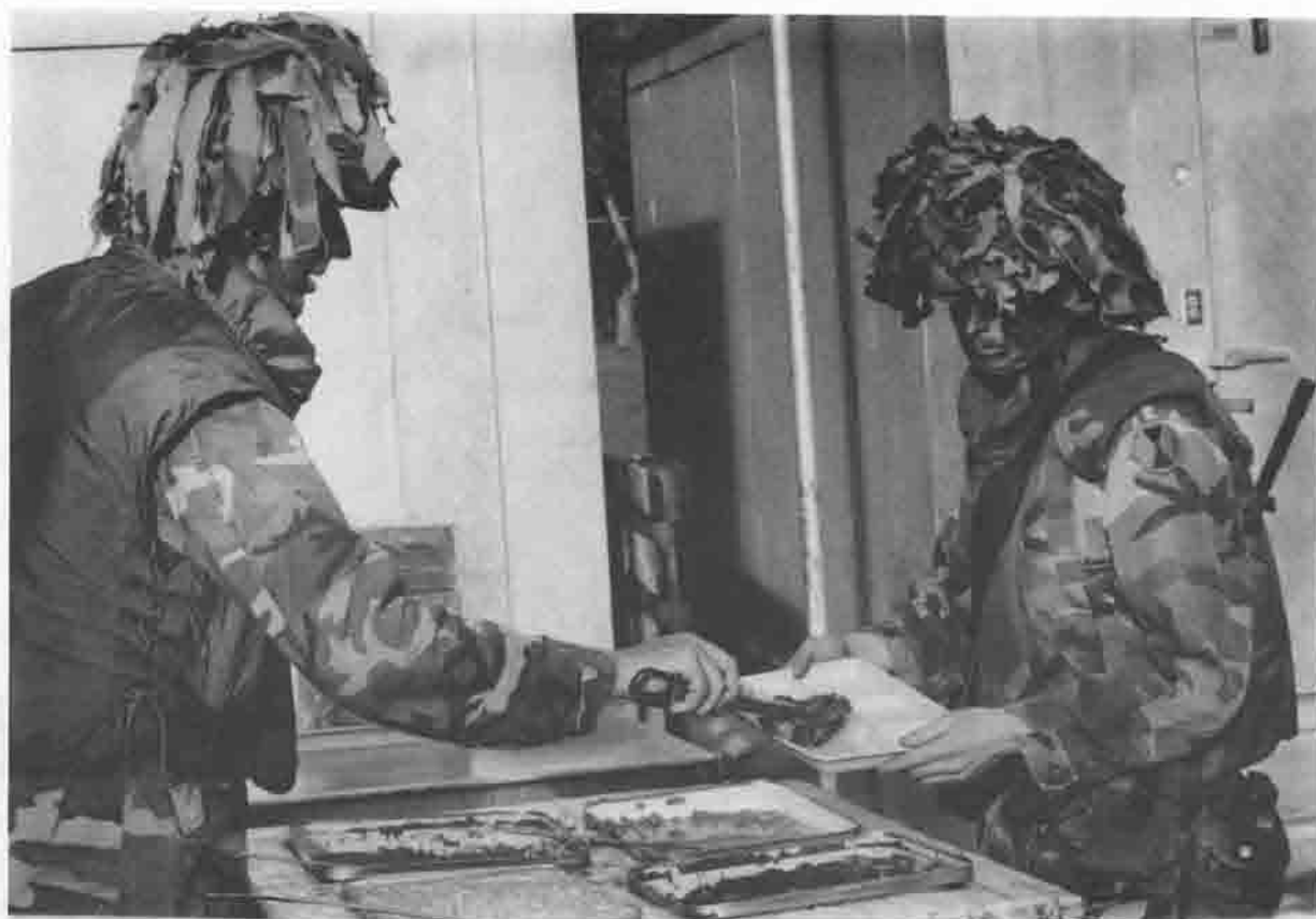
HOT T-RATIONS AND TAKING A BREAK.