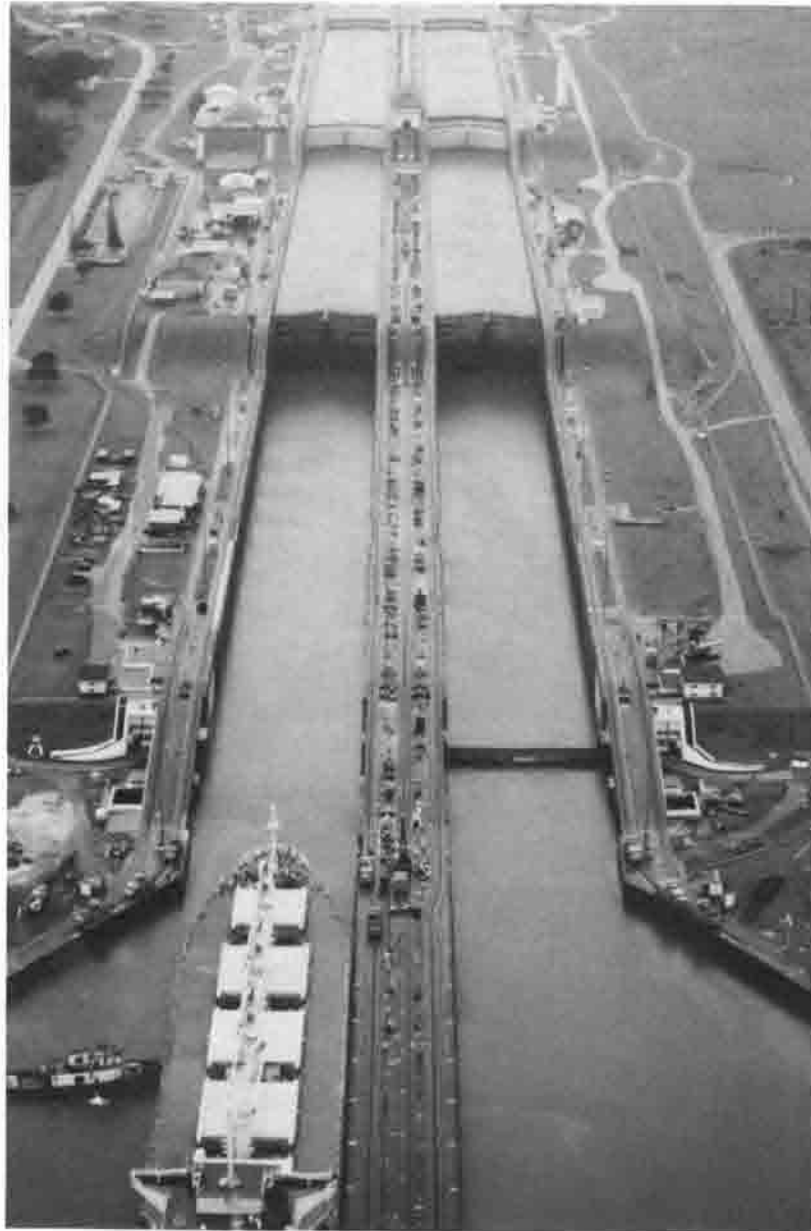
GATUN LOCKS AT THE NORTH END OF THE CANAL ARE AN IMPORTANT KEY TO KEEPING THE CANAL OPEN. 3RD BRIGADE WAS CRITICAL IN THEIR DEFENSE AGAINST ATTACK OR SABOTAGE.