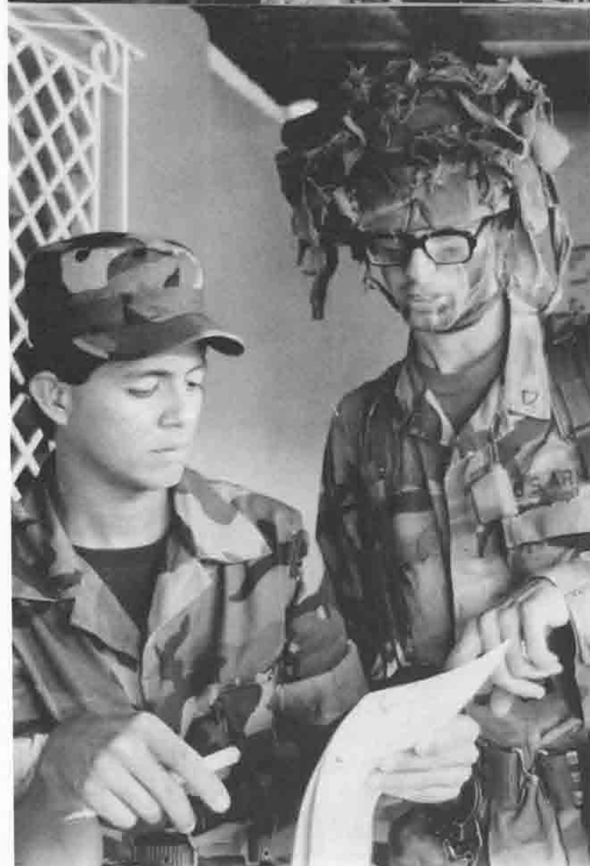
COMBINED PATROLS BECOME THE BACKBONE OF NATION BUILDING