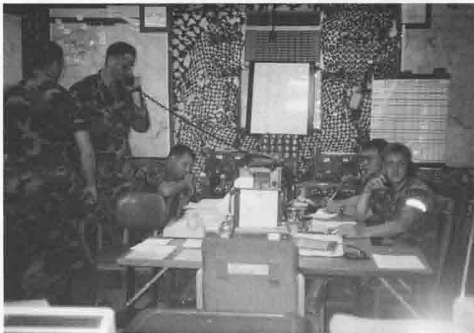
3RD BRIGADE OPERATIONS AND COMMUNITY SUPPORT IN COLON.