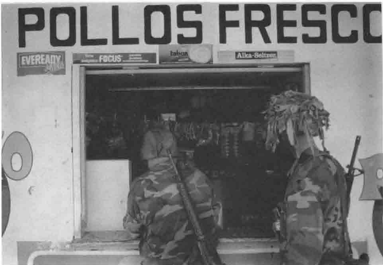
LIGHTFIGHTER TAKES A BREAK AT LOCAL ESTABLISHMENT.