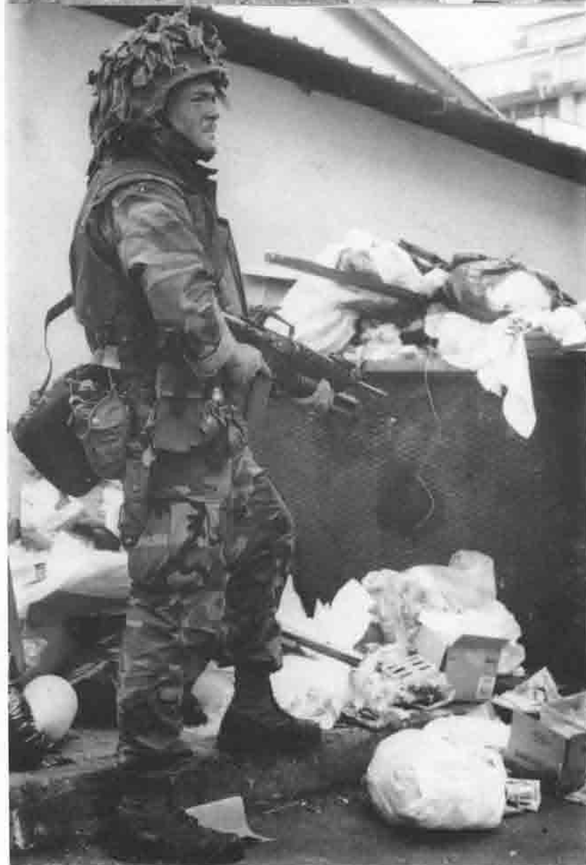
LIGHTFIGHTERS ON PATROL