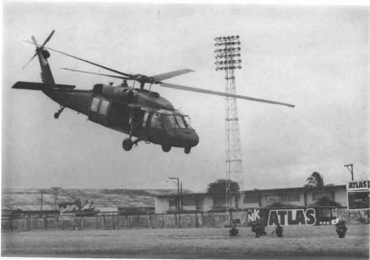
AVIATION OPERATIONS IN COLON AND DEFENSIVE POSITION AT ALLBROOK AFB.