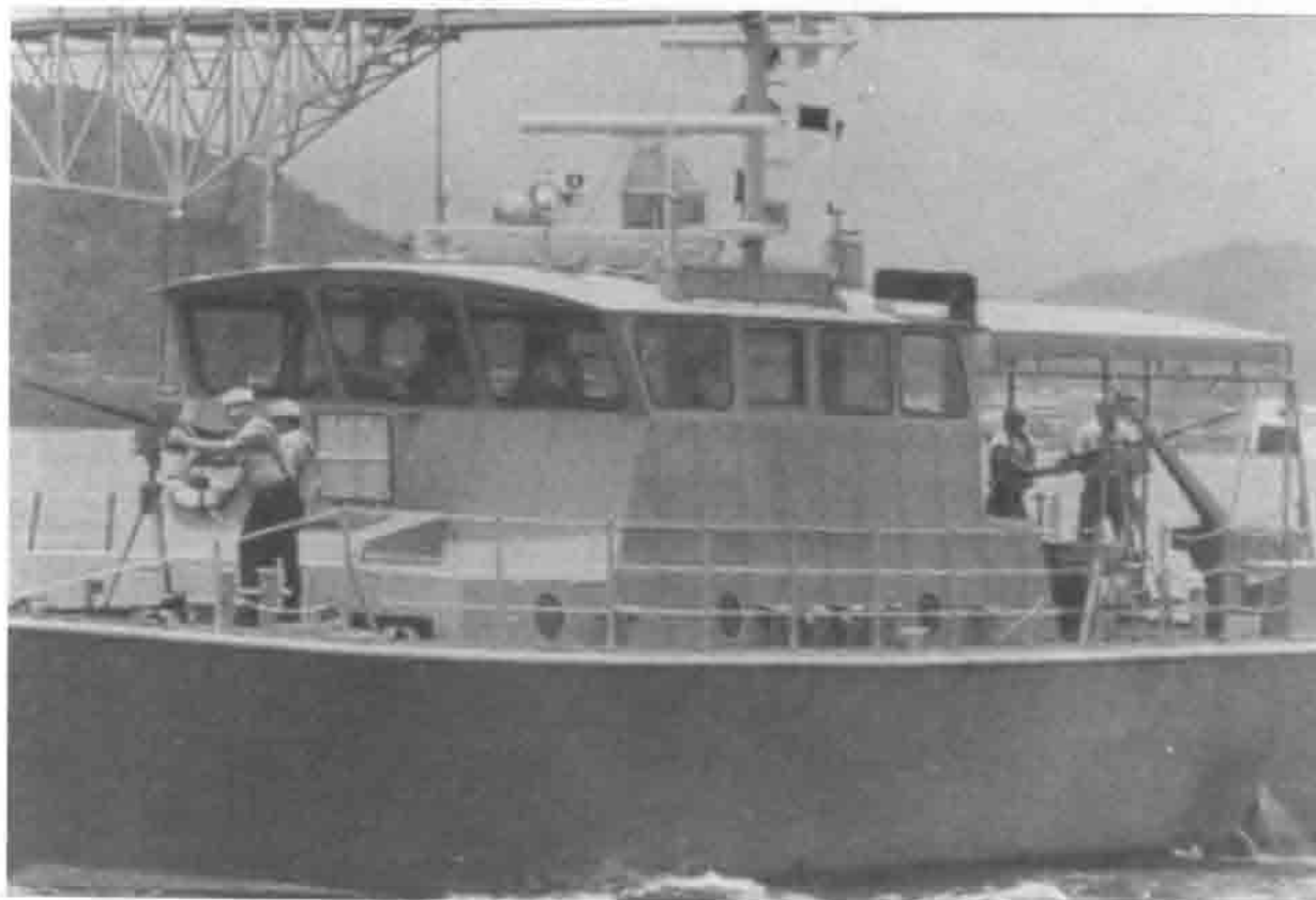
PDF NAVAL CRAFT OPERATING IN THE CANAL AND ANTI-AIRCRAFT WEAPON (ZPU-4).