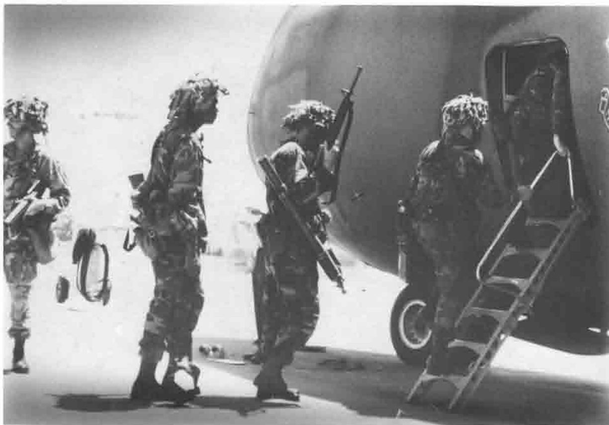
LIGHTFIGHTERS DEPART TRAVIS AFB AND ARRIVE HOURS LATER IN PANAMA AT HOWARD.