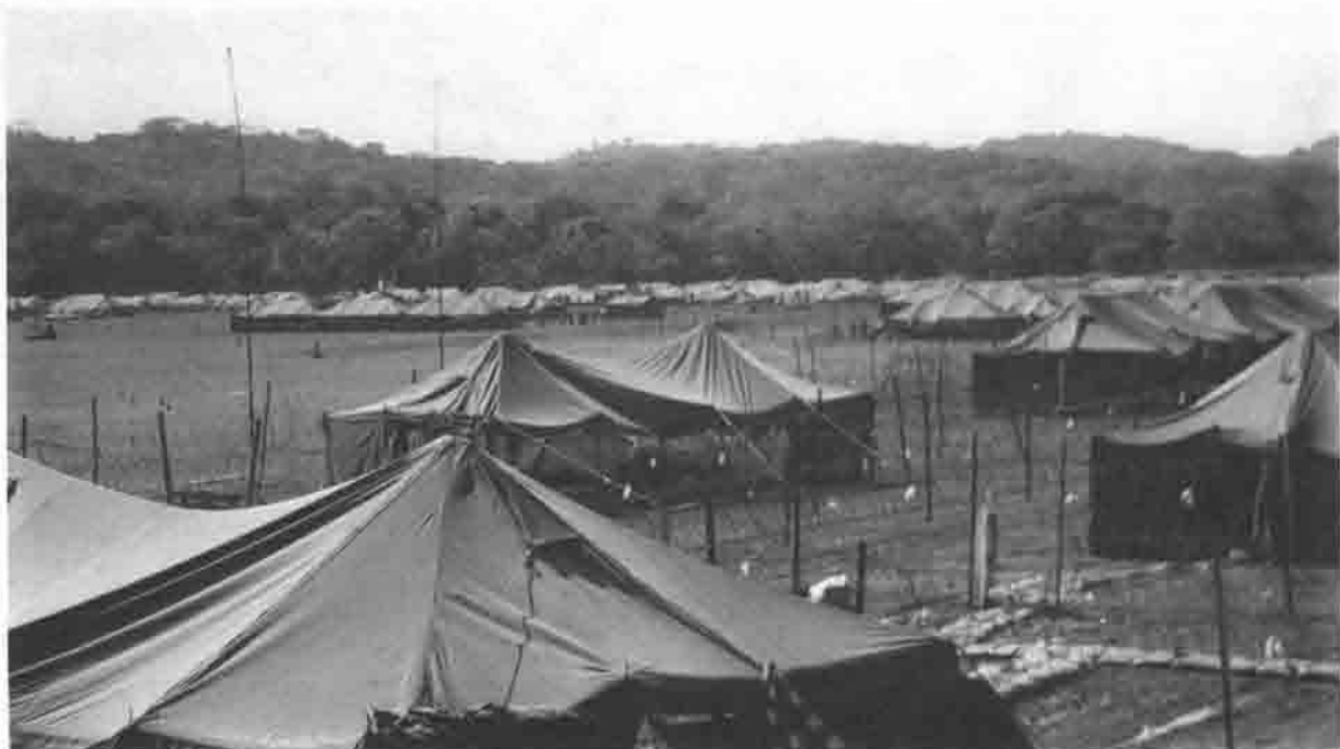
PRISONERS WERE HELD AT THE CENTRAL EPW FACILITY AT EMPIRE RANGE WHICH WAS NEXT TO THE PANAMA CANAL.