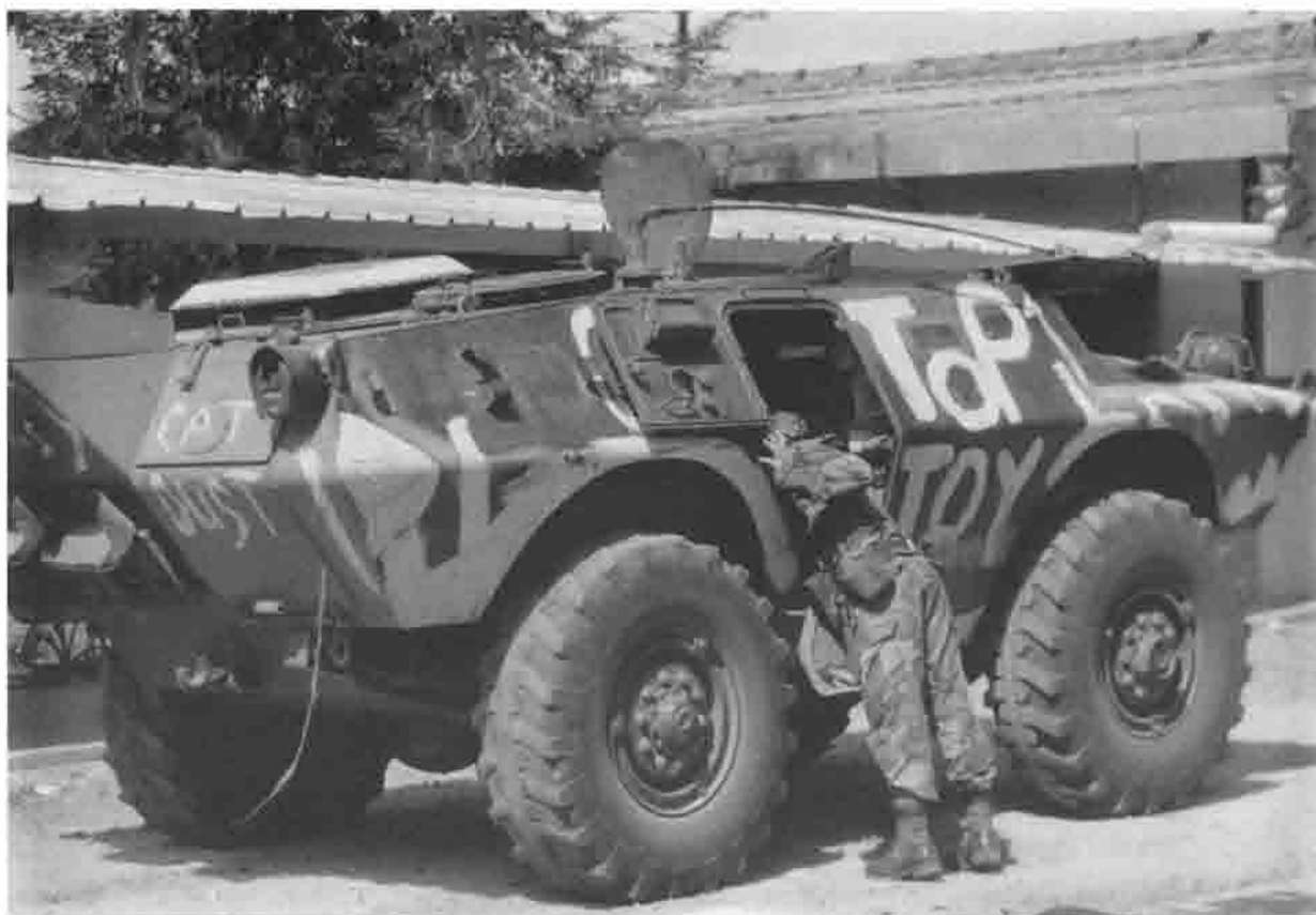
CAPTURED V-150 APC AND LIGHTFIGHTERS PREPARING FOR FUTURE OPERATIONS