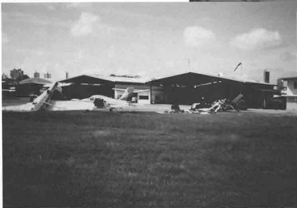
...HIS AIRPORT AT PATILLA...