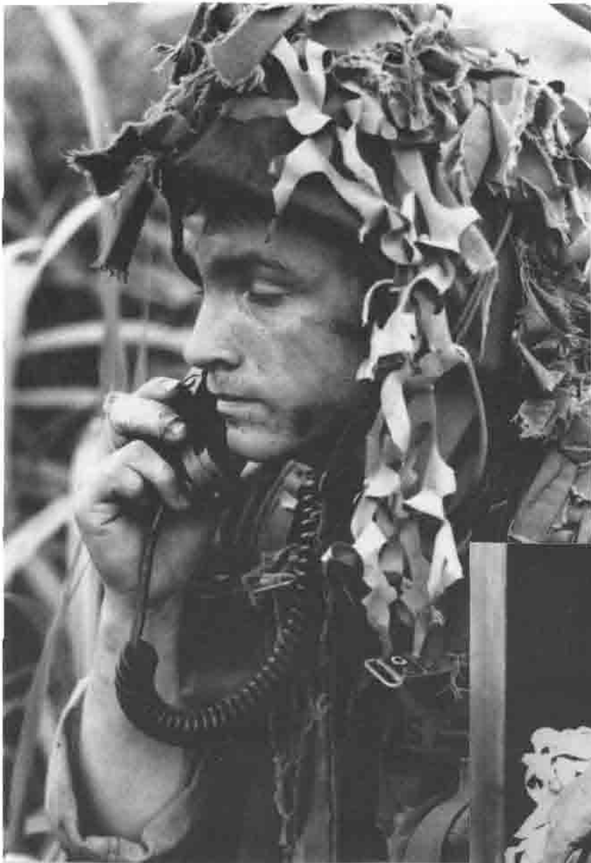
LONG HOURS FACE A LIGHTFIGHTER.