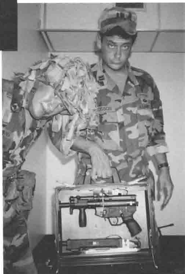
...AND SPECIAL WEAPONS.