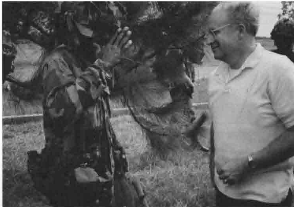
SECRETARY OF DEFENSE, MR. CHENEY MEETS WITH LIGHTFIGHTERS AND PRESENTS AWARDS AT RIO HATO.