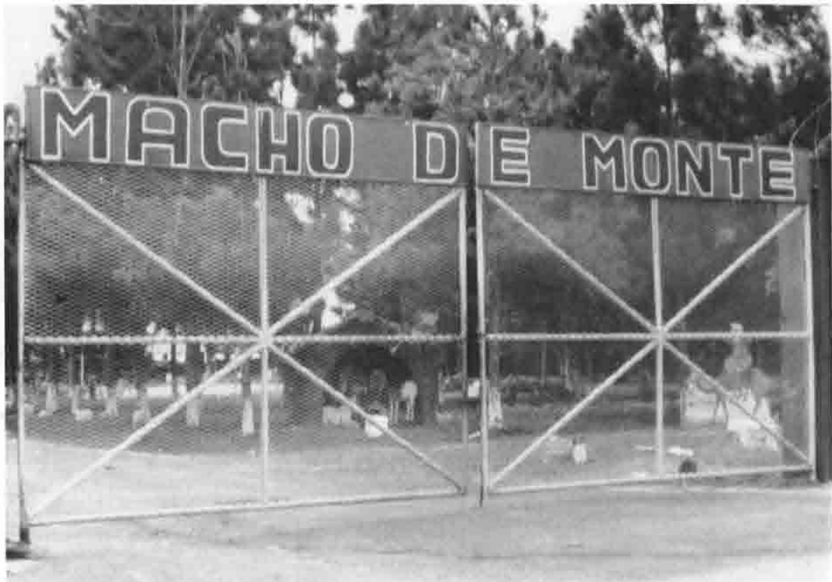
HOME OF THE "MOUNTAIN MEN" 7TH INFANTRY COMPANY AT RIO HATO.