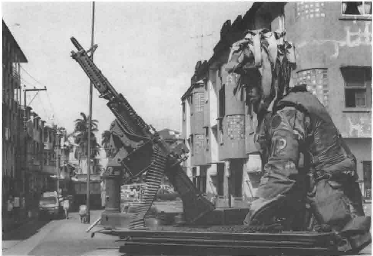
PATROLS AND DEFENSIVE POSITIONS IN COLON.