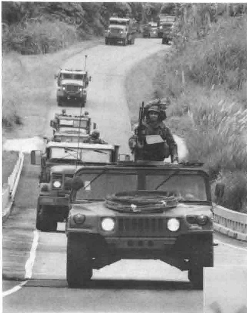
OPERATION NIMROD DANCER MAY-DEC 1989