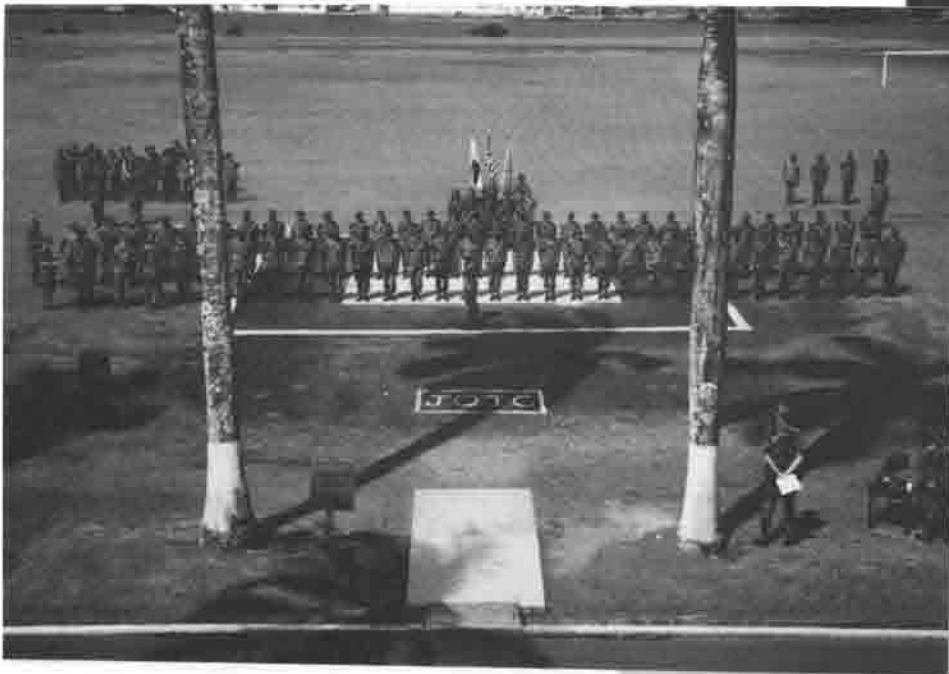
JUNGLE OPERATIONS TRAINING COMMAND (JOTC) CADRE RECEIVE CIBS AND AWARDS. THEY SERVED WHILE OPCON TO 3D BDE (TASK FORCE ATLANTIC).