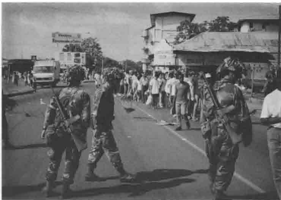
3RD BRIGADE CONDUCTS SCREENING OPERATIONS WHILE RESTORING LAW AND ORDER IN COLON.