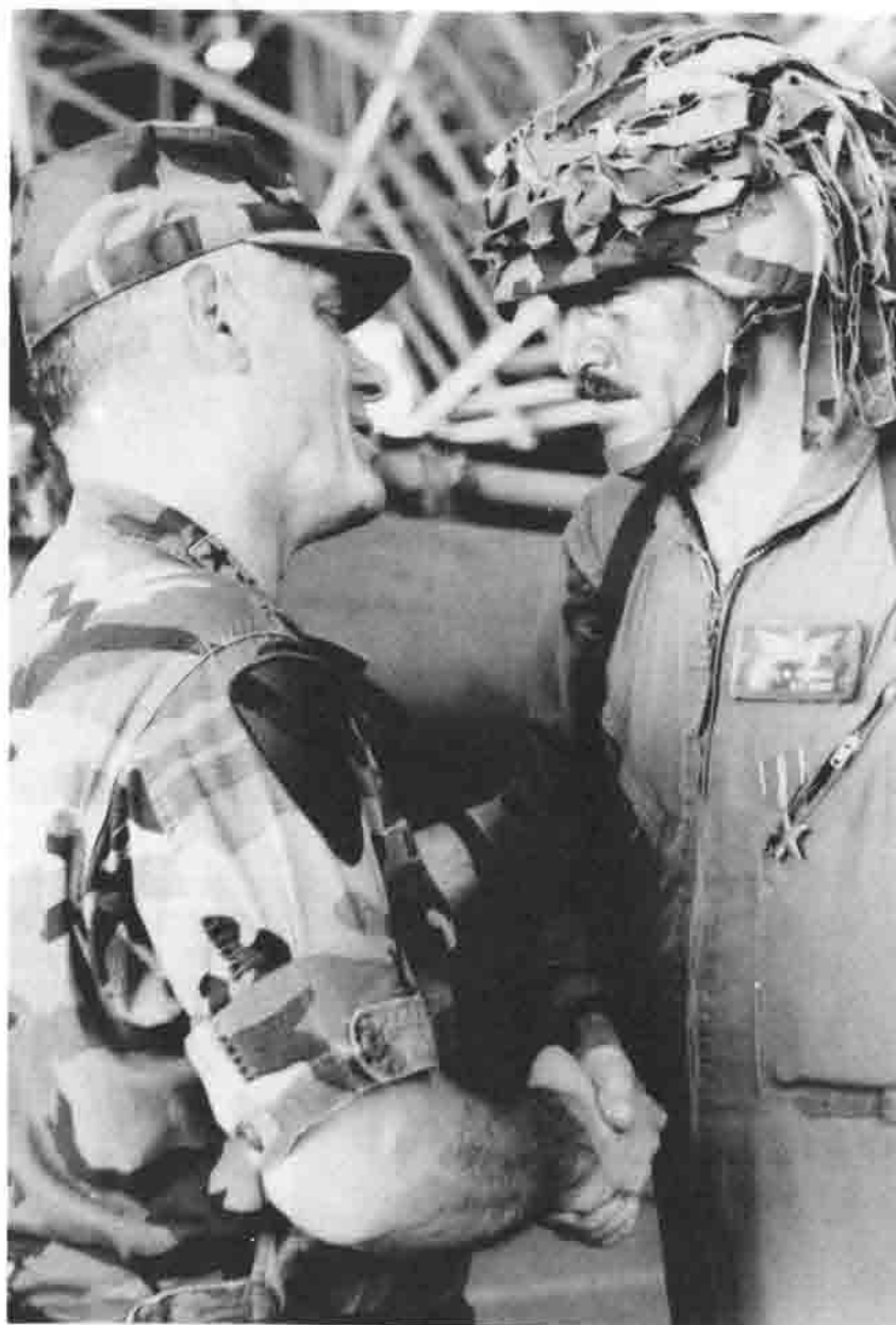
GEN VUONO CONGRATULATES LIGHTFIGHTER AVIATOR!