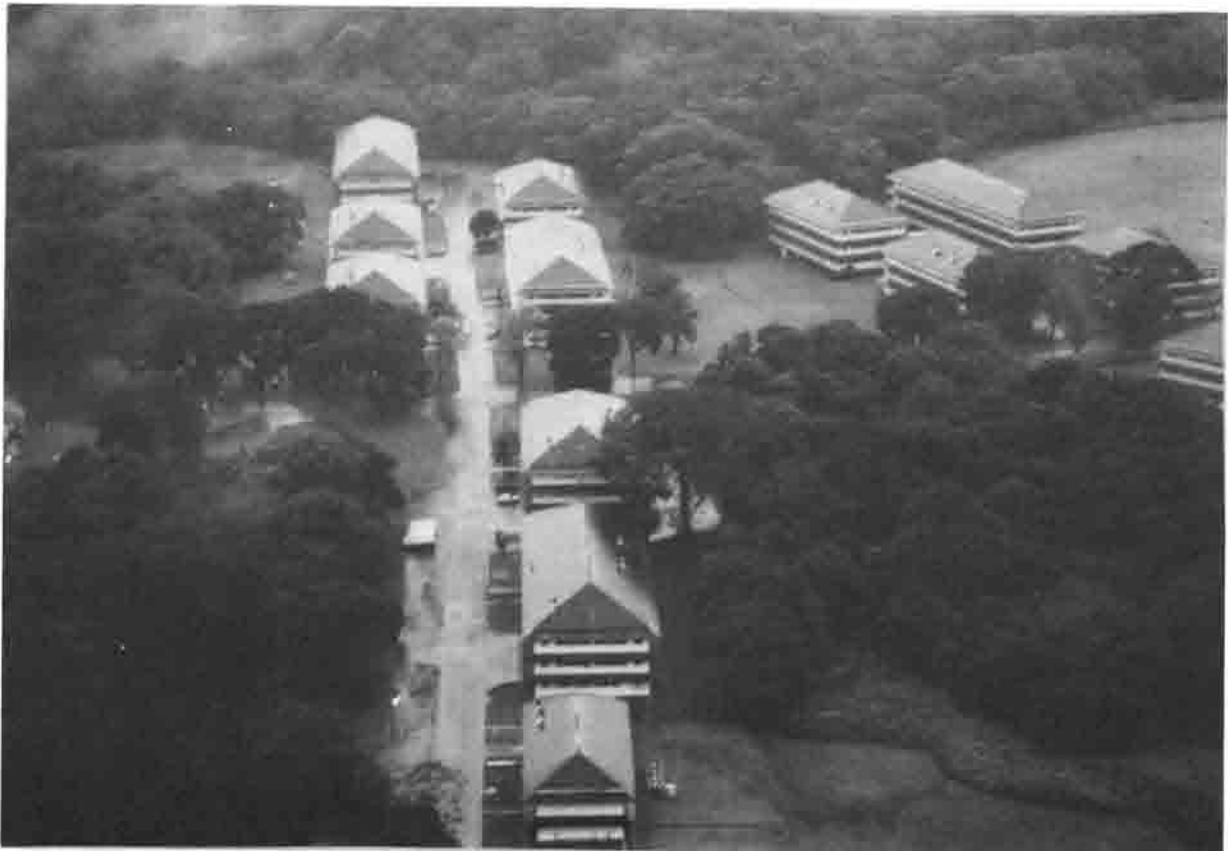
FORT ESPINAR, GARRISON LOCATION OF THE PDF 8TH INFANTRY COMPANY.