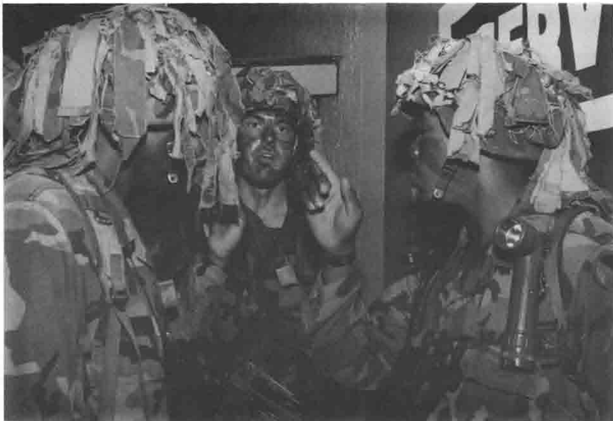
3/9 INFANTRY BATTALION LIGHTFIGHTERS PREPARE FOR AND MOVE OUT DURING NIGHT OPERATIONS IN THE SLUMS OF PANAMA CITY.