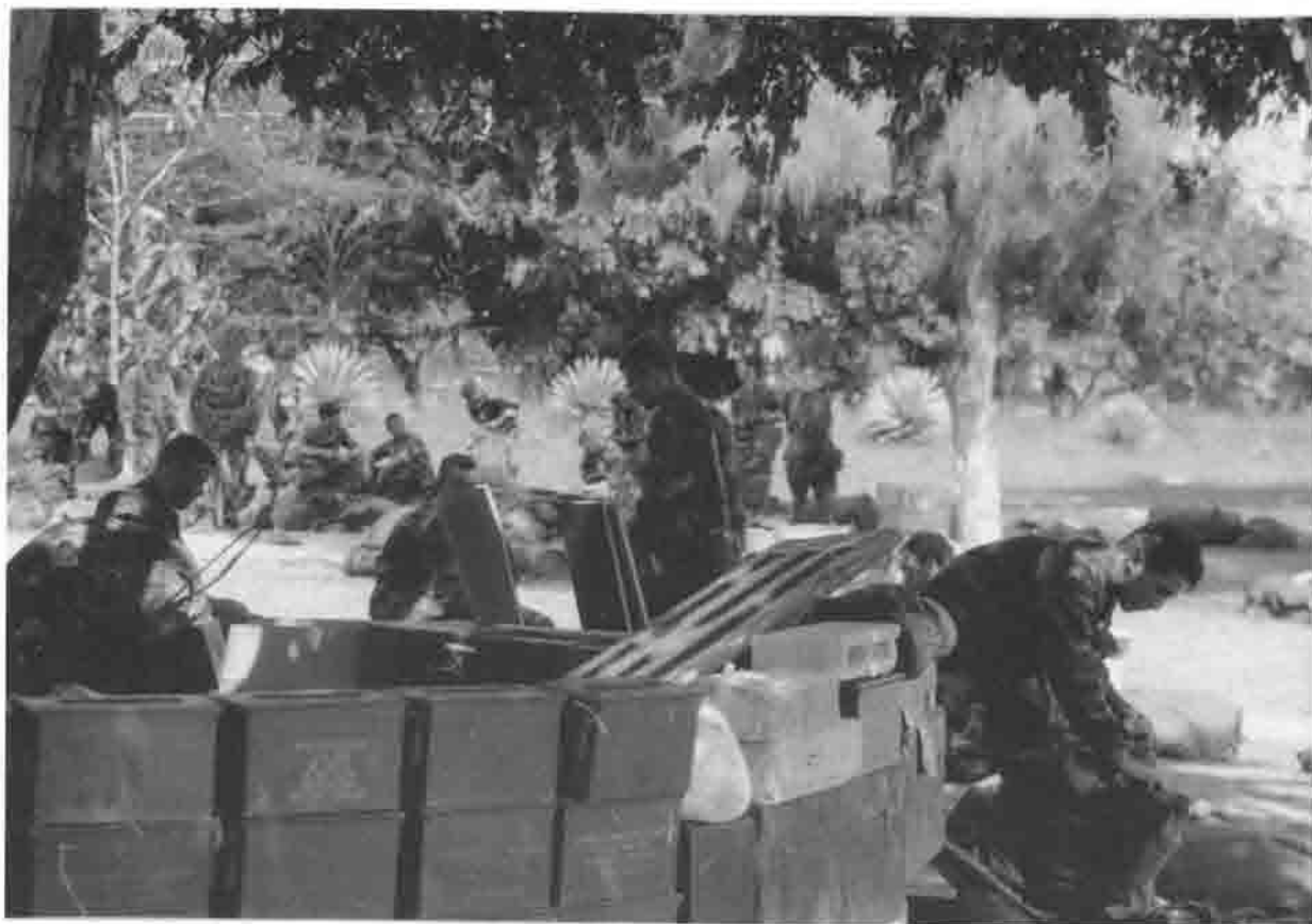
PREPARING FOR FUTURE OPERATIONS AT RIO HATO.