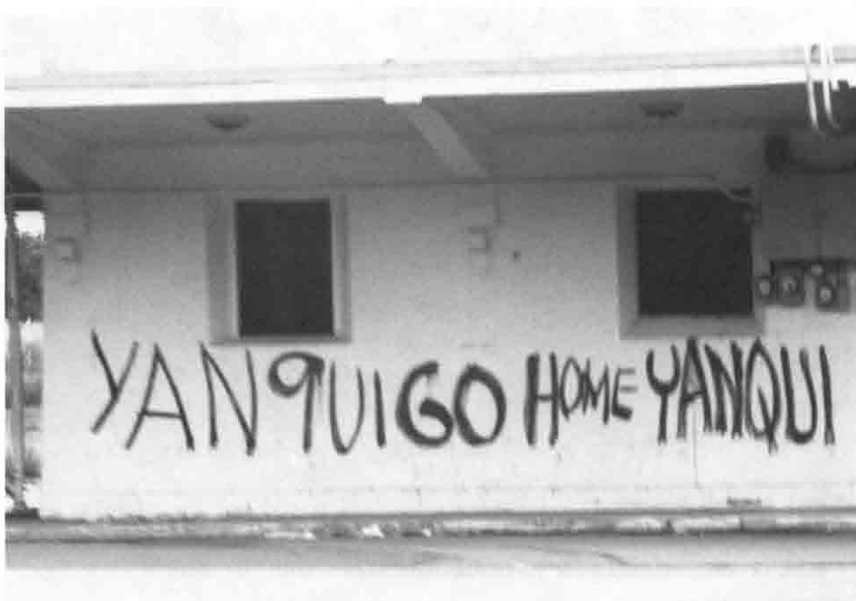
ANTI-AMERICAN GRAFFITI ONE MONTH PRIOR TO JUST CAUSE.