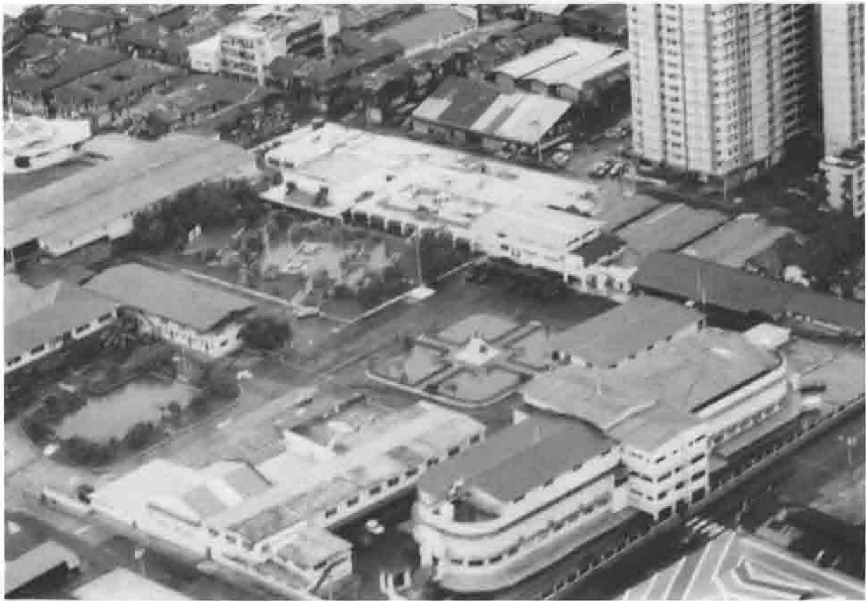
NORIEGA'S HEADQUARTERS AT "LA COMMANDANCIA". BEFORE AND.....AFTER.