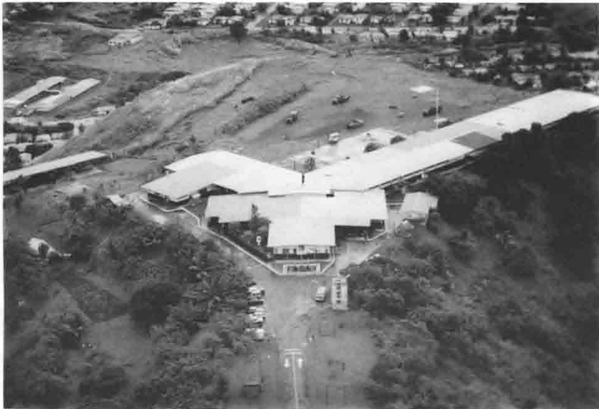
GARRISON LOCATION OF PDF 1ST INFANTRY COMPANY AT TINIJITAS. NOTE THE .50 CAL MACHINEGUN POSITION AT THE LOWER LEFT OF THE BOTTOM PHOTO. TASK FORCE AVIATION FLEW THE MISSION TO CAPTURE THE SITE, ON 20 DECEMBER.