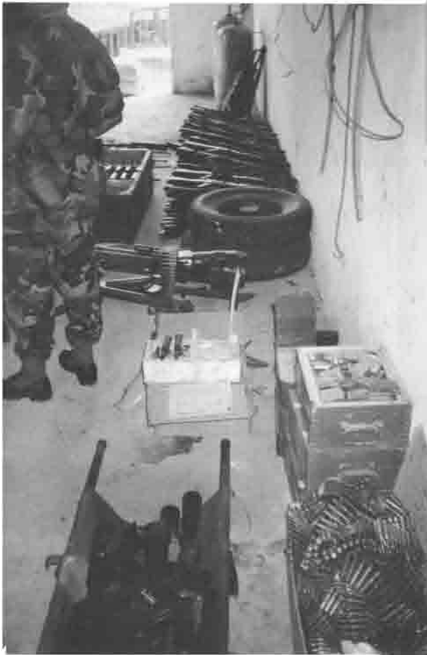
CAPTURED WEAPONS AND HOMEMADE BOMB TRAINING FACILITY AT THE AIRPORT IN DAVID.