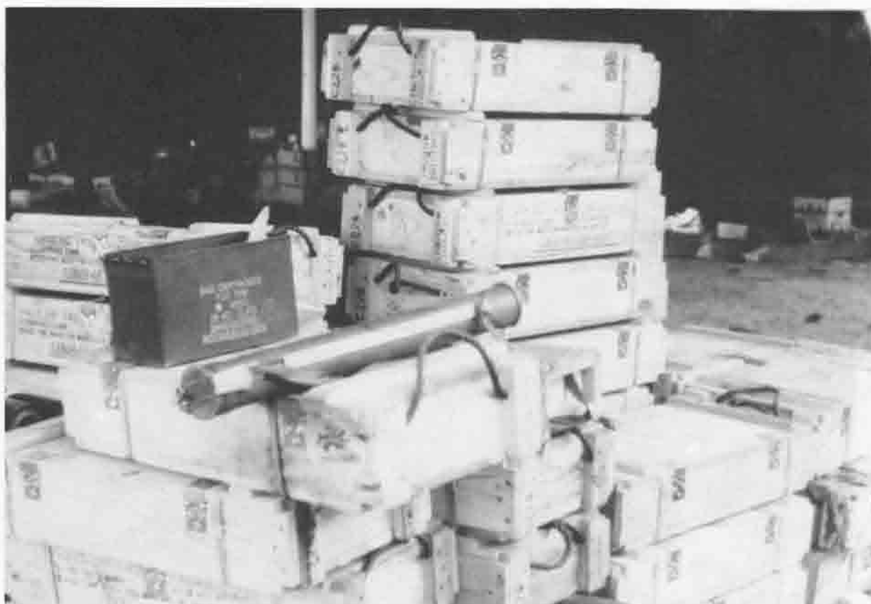
LITERALLY TONS OF WEAPONS AND AMMUNITION WERE FOUND AND SHIPPED BACK TO THE U.S. BY THE 7ID(L). THE WEAPONS INCLUDED ANTI-AIRCRAFT GUNS, ANTI-TANK WEAPONS AND THOUSANDS OF COMMUNIST MADE AK-47S.