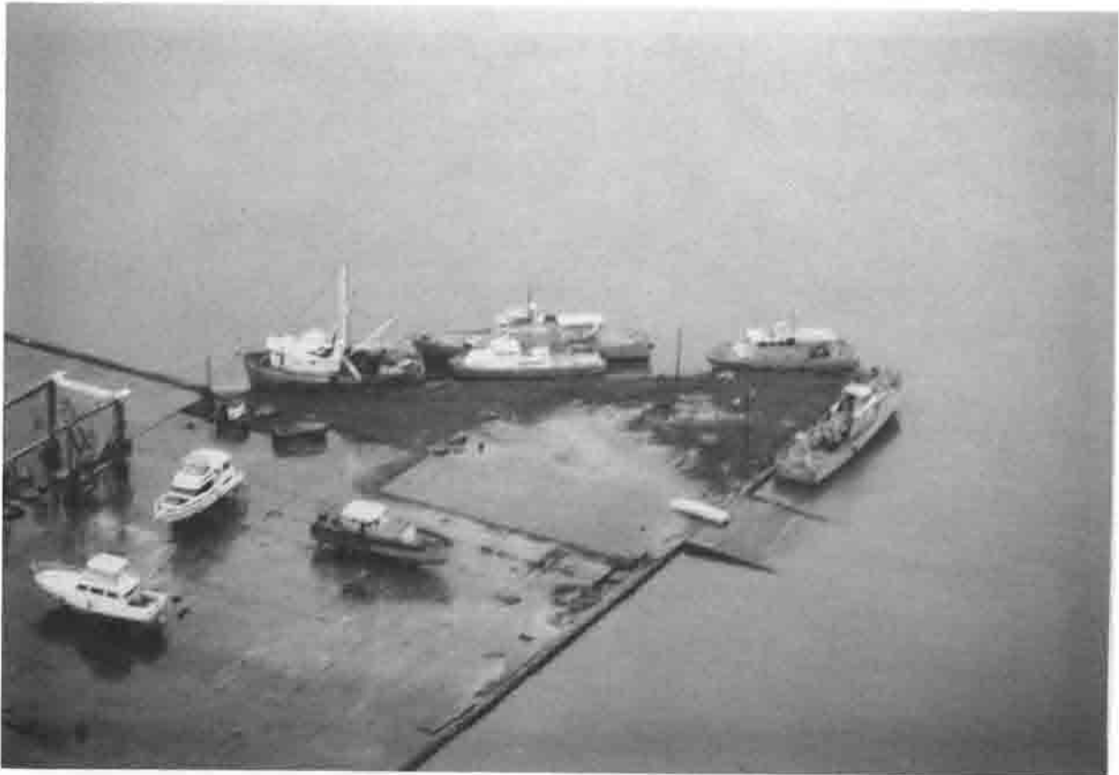
PDF NAVAL INFANTRY COMPANY DOCKS AT COCO SOLO IN THE VICINITY OF COLON.