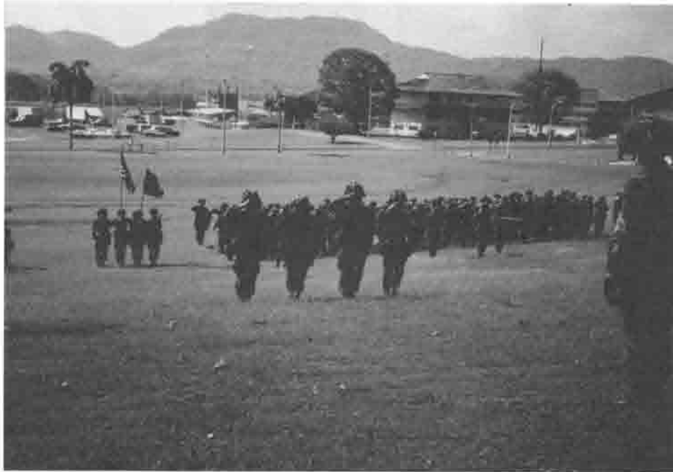
LIGHTFIGHTERS BID FAREWELL TO PANAMA AND RETURN HOME !